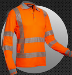
X-VIZ-COMFORT-LONG 6220 RWS Art. no. 2.76.211.00