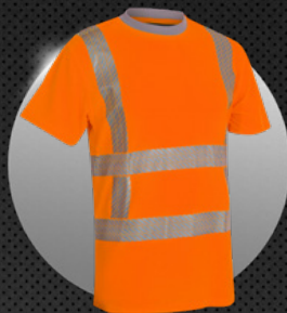
X-VIZ-FLEX 6200 RWS Art. no. 2.76.201.00